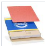
Sheets 230 x 280 mm