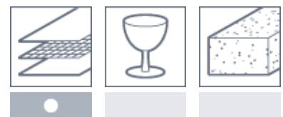
Composite Glass and Ceramics Stone