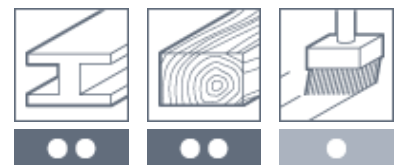
Metal Wood Lacquer